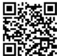
Bracket A (Pro)

Download the Scoreholio app to register!