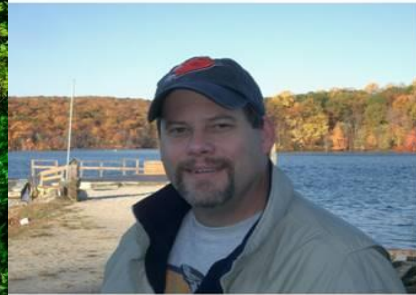
April 6, 1961 - February 23, 2017

The Lake Forest Yacht Club will soon have a new structure added to our beautiful property. Later this summer, work will be done at the swim team peninsula preparing for the placement of a 12' stone lighthouse. This beautiful ornamental structure will illuminate from dusk to dawn to provide added guidance to our member boaters as well as add ambiance to our club. This nice addition to the club property will be known to all as "The Lake Forest Lighthouse"