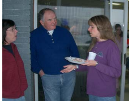
(Continued from page 1)

ment was reborn as a foosball tournament. DJ Earl pulled out some participatory games for kids as well as adults - in addition to his collection of good tunes. And an awesome face painter put some fantastic art on the mugs of many a Lake Forest child. The event was held within the club and reconfigured to keep everyone dry. And as if the logistics of rain interference weren't enough, our roasted pig decided to take the long cut and make a delayed entrance. But our 100 plus attendees were determined to have a fun party and that's exactly what they did. Good neighbors, good food, good entertainment, good conversation, good music — what more could you ask for on a rainy Saturday afternoon?