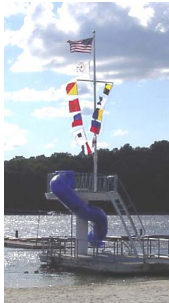
New fiberglass flagpole and yard arm with signal flags spelling out Lake Forest that was installed on the dive tower in August.

The Lake Forest Yacht Club, 35 Yacht Club Drive, Lake Hopatcong, NJ 07849