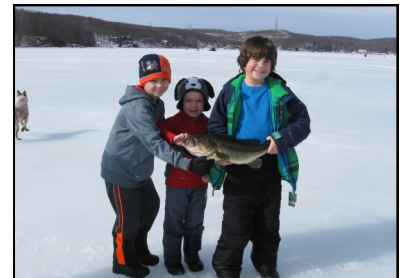
More pictures on page 6