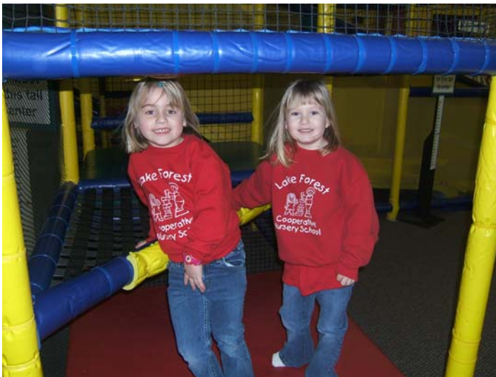
Lake Forest Nursery School Field Trip to Giggles