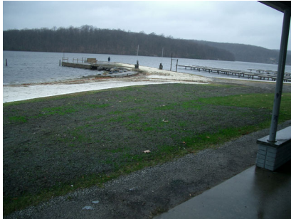
(Location of new Patio)